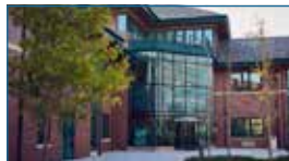
Ellab Academy UK

Training courses can also be arranged in other countries and/or directly on-site upon request