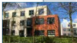
Ellab Academy Benelux