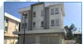
Ellab Academy Philippines

Contact: Gladys Apiado dubai@ellab.com +971 43211256