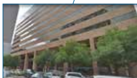
Ellab Academy USA

Contact: Corinna Oetjen coe@ellab.com +49 4286 92662 45